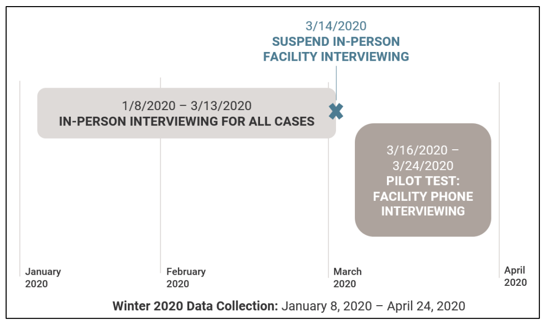
Figure 2: Timeline of Facility Phone Pilot Test