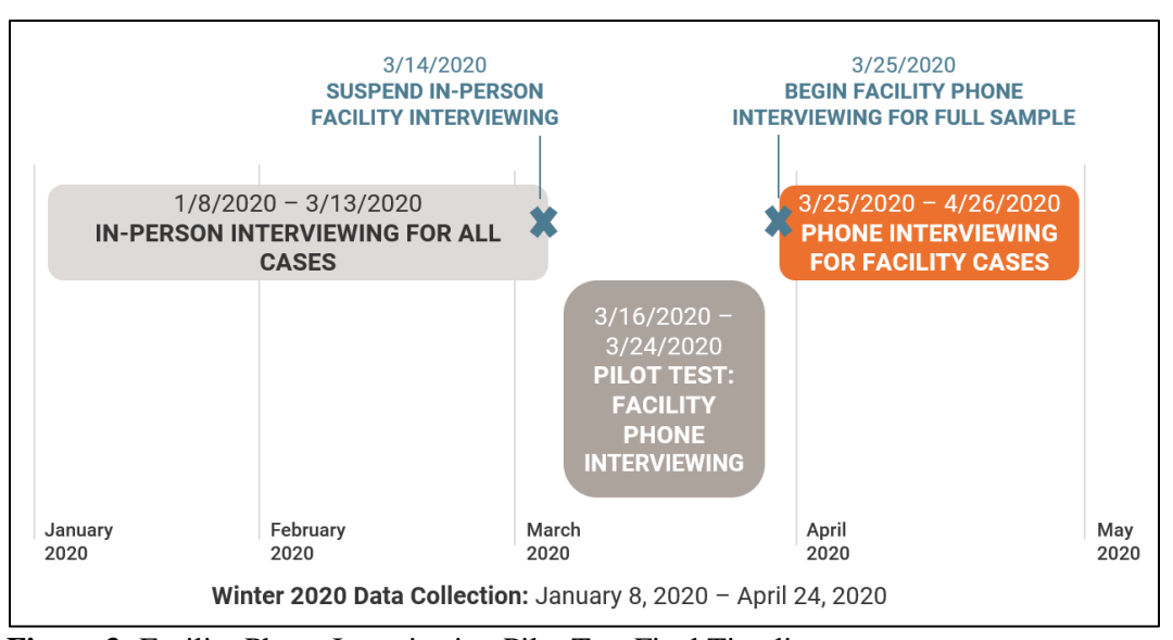
Figure 3: Facility Phone Interviewing Pilot Test Final Timeline

Based on the results of this rapid and small Facility pilot test, NORC and CMS determined it was feasible to continue phone data collection in the Facility component on a wider scale. Facility data collection fully resumed by phone within two weeks of pausing in-person interviewing, as seen in Figure 3.