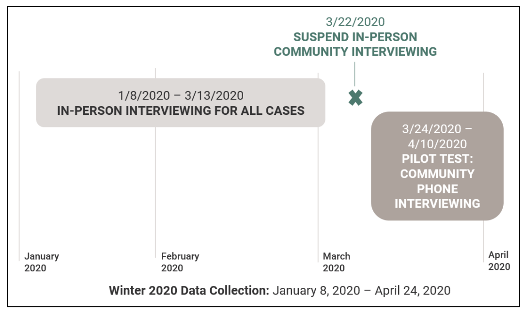
Figure 4: Timeline of Community Phone Pilot Testing